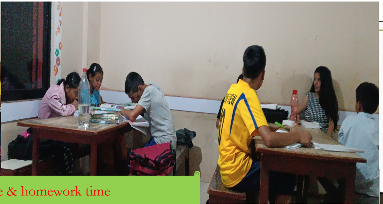
Evening practice & homework time